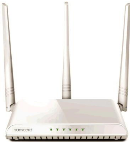
Model No. RNH326

3*5dbi high gain omni-directional antennas: 3*5dbi high gain omni-directional antennas with 300M wireless transmission rate ensure stable WiFi with WiFi coverage up to 300m.